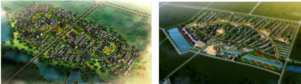
Fig. 9. Shifang Village Tonggan University original Masterplan.

changed into a themed commercial village rather than a soft tourist-orientated sustainable community. The success of this development is questionable. Shifang Tourist village will be surrounded by new infrastructure and industry without farmland.