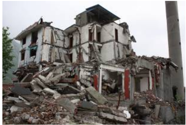
Fig. 13. Hanwang Town Earthquake Scenery