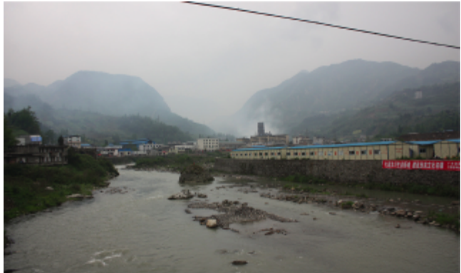
Fig. 12. ShuiMo Before the Reconstruction