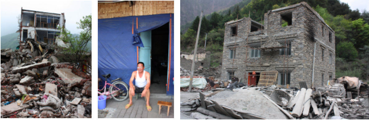
Fig. 1. Hanwang Town Totally Destroyed by the Earthquake