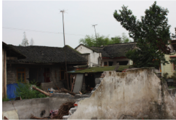
Fig. 7. Mianzhu Village Sustainable Small-scale Farm Unit. Fig. 8. Shifang Village Damaged Farmhouse Constructed from Local Weak soil

In juxtaposition, the second project of Green Cross demonstrates how non-profit organizations can struggle within their own limits and consequently are overruled by top-down governmental political decision-making process. Shifang is much bigger than Mianzhu village with 2000 units. Green Cross collaborated first with 'Foundation One', (a Hong Kong based charity). Instead of mobilizing and involving the local population Tongan University Planning Institute prepared an overall Master plan for the new village. The new village vision was emphasized on Sichuan small-scale rural tourism. The sponsor guaranteed 100% funding, which is beneficial for inhabitants but reduced the influence of both, the local community and Green Cross towards the planning process. The village was divided in different zones according to typical Sichuan themes such as tea, painting, water or grapes. Even though sustainability was not the major rebuilding motivation like in Mianzhu Village, environmental awareness still formed the base of Green Cross's involvement. The village space was to be reduced to one third of the original layout with two and three story houses featuring local architecture. Due to the large extent of the project funding and planning difficulties arose; the scope was to be too big for a small organization like Green Cross .