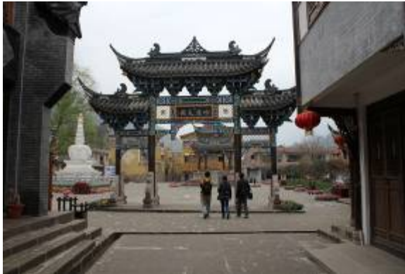
Fig. 11. ShuiMo: Newly Designed Ancient Street

The planning process is top-down without any local involvement. Last year, Beijing Central government shortened the construction time to two years, which was still achieved under enormous stress by Foshan government. As a result of the time pressure, the finished quality on site was found to lack design details, and poor building and design quality. The construction costs were extremely high for a small town redevelopment. Sustainable measures were not followed, either in materials or amenities, which has been widely recognized as one of the principles for disaster reduction. One can say that ShuiMo is a success for the central government. It can also be considered an over designed theme park village rather than a successful recapturing of regionalism to serve the needs of local population to sustain their lives in the future. Any vulnerability upgrade will depend on tourism.