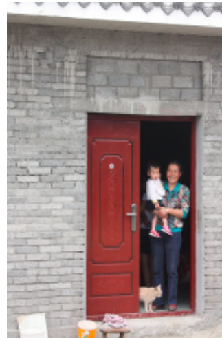
Fig. 16. Local Population near ShuiMo