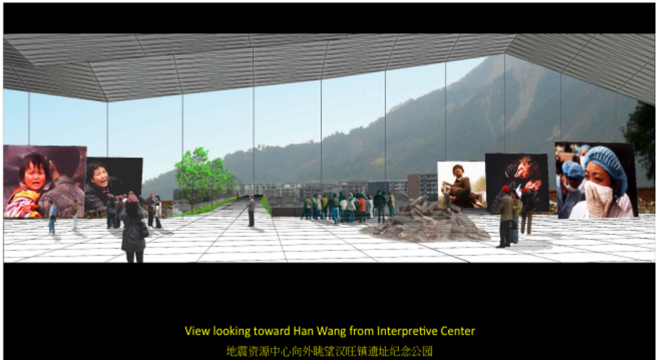
Fig. 15. Hanwang Vision Plan: View over the Ruins of Hanwang